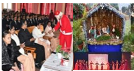
SMCIC Lucknow celebrated Christmas with great joy and fervor,

A Gratitude Week was celebrated by SMCIC family, focusing on fostering appreciation and reflection among sisters, teachers, co-workers and students. The week began with meditation sessions that promoted mindfulness and inner peace. Special prayer gatherings followed, allowing all to come together in thanksgiving for their blessings. Students were encouraged to write gratitude letters, expressing thanks to teachers, friends, and family. On the final day, a large screen of gratitude notes, containing messages of appreciation from the entire school, was displayed at the school's entrance. This initiative successfully cultivated a spirit of gratitude and strengthened the family bond.